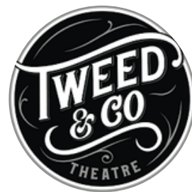
Tweed & Co