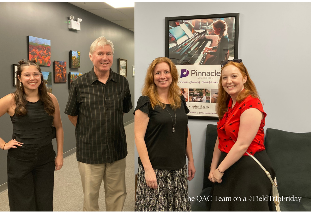
The QAC Team on a #FieldTripFriday

Thanks to funding from Canada Summer Jobs and the Enrichment Centre for Mental Health we were able to hire three summer students for July and August.