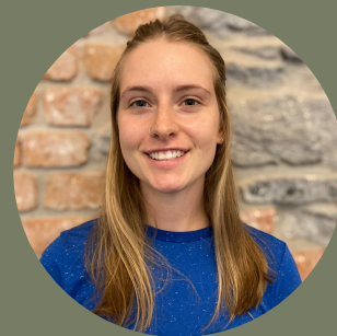
Social Media Community Manager