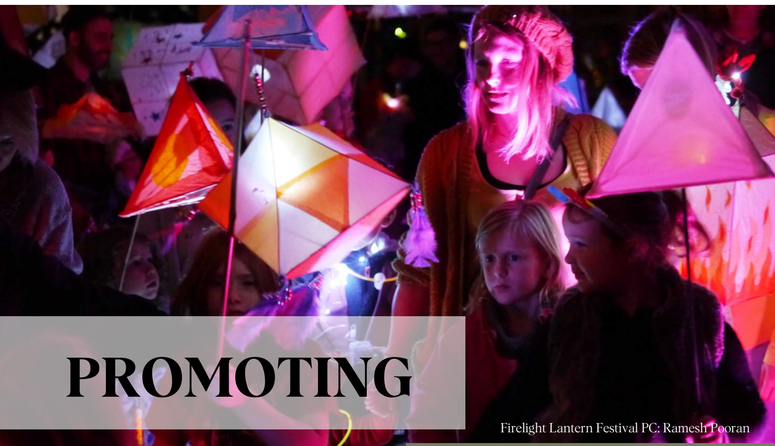
Firelight Lantern Festival