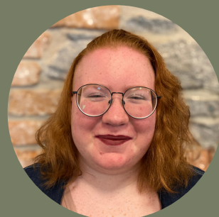
Special Events Coordinator